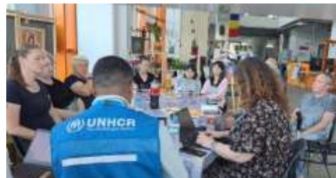
On 10 July, UNHCR conducted a focus group discussion with refugees at the Nicolina Humanitarian and Social Assistance Centre in Iași.

UNHCR is grateful to the donors for unearmarked and softly earmarked contributions to the Ukraine situation. UNHCR in Romania is also grateful to donors contributing to 2025 programmes. For more details: Romania Funding Update – 2025