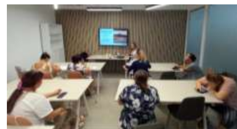
On 10 July, UNHCR held an information session for persons with disabilities at the RomExpo Community Centre in Bucharest.