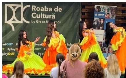
On 28 September, UNHCR in collaboration with the NGO Green Revolution (Roaba de Cultură) and RRP partners, held the fourth and final edition of “Together in the Park”.

28 September, UNHCR in collaboration with the NGO Green Revolution (Roaba de Cultură) and partners of the Refugee Response Plan (RRP), held the fourth and final gathering of “Together in the Park”, building on the previous events during this summer celebrating social cohesion, togetherness, and the power of community. The open-air event on the theme “Fun, Art and Games – bringing communities together through play, arts and culture” featured multi-cultural arts, games, and workshops for children. The event successfully brought together over 1,000 Romanians, refugees and migrants in a playful manner forging bridges between the communities in Bucharest.