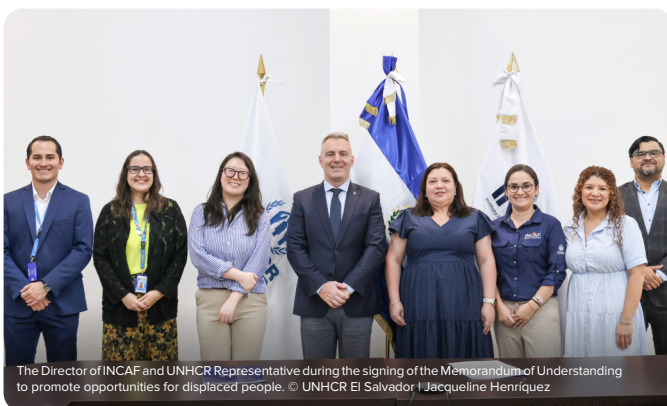
The Director of INCAF and UNHCR Representative during the signing of the Memorandum of Understanding to promote opportunities for displaced people.