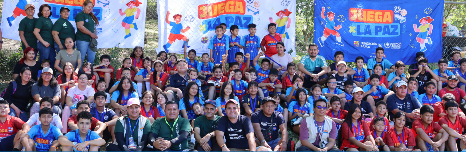
Communities once separated by violence gathered to participate in sports tournaments, transforming division into peace through the “JuegaLaPaz” project.