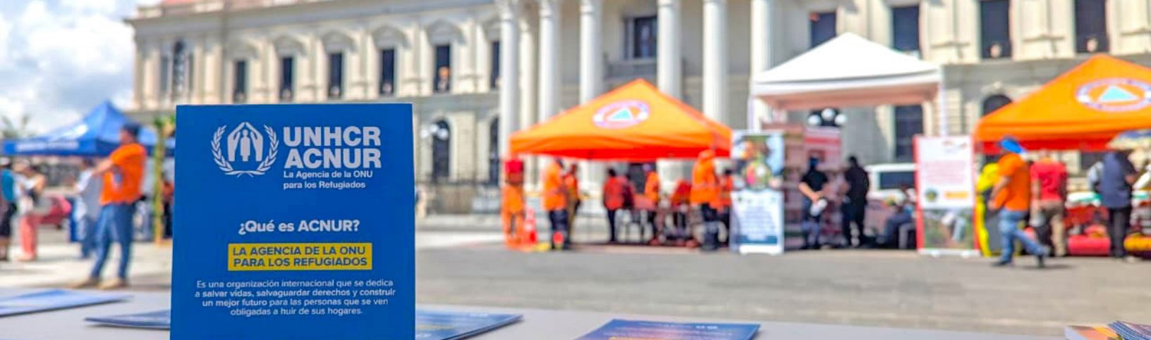
UNHCR presented joint efforts to protect displaced families affected by natural disasters in the framework of National Disaster Risk Reduction Week.