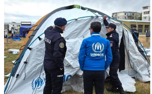
During 28-30 April, UNHCR participated in Exercise Danubius Galatiensis 26, a large-scale simulation exercise designed to test Romania’s preparedness for potential mass arrivals of refugees.

Between 28 and 30 April, UNHCR participated in Exercise Danubius Galatiensis 26, a large-scale simulation held in Galați, designed to test Romania’s preparedness for potential mass arrivals of refugees, organized by the General Inspectorate for Immigration (GII). As the first pilot of its kind in Europe, it brought together national authorities, including the Border Police (IGPF), the General Inspectorate for Emergency Situations (IGSU), the General Directorate for Social Assistance and Child Protection (DGASPC) in Galați, the Ombudsperson, and civil society partners. It assessed coordination, decision-making, and border, asylum and reception procedures ahead of implementation of the EU Pact on Migration and Asylum in June. The exercise provided a valuable opportunity for UNHCR to engage with GII and other agencies, identifying protection risks and good practices and contributing to strengthened, protection-oriented preparedness.