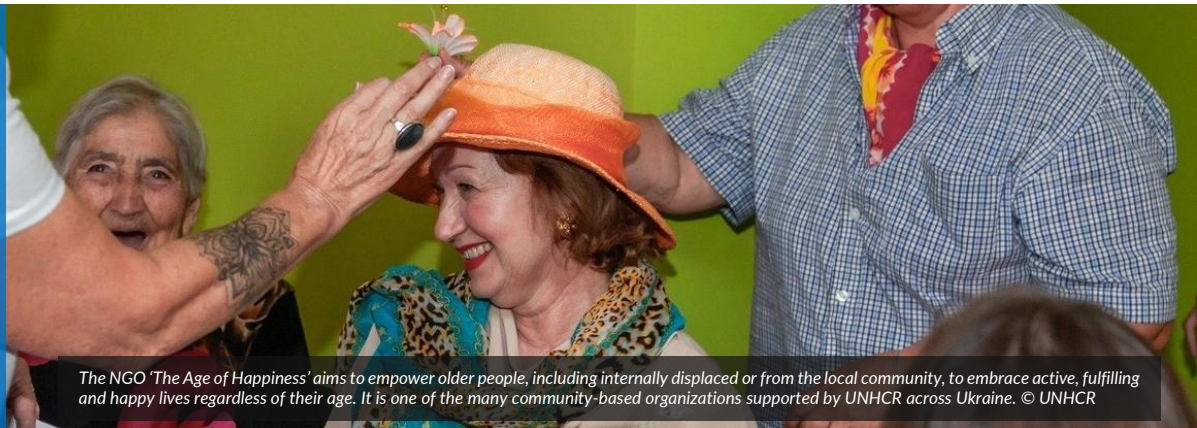
The NGO 'The Age of Happiness' aims to empower older people, including internally displaced or from the local community, to embrace active, fulfilling and happy lives regardless of their age. It is one of the many community-based organizations supported by UNHCR across Ukraine.