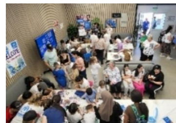
On 29 May, UNHCR marked International Children’s Day with an event at UNHCR’s Community Centre.

On 29 May, UNHCR, marked International Children’s Day at UNHCR’s Community Centre at RomExpo in Bucharest, with an event attended by more than 150 children from refugee and host communities. The event was a great success, featuring interactive activities focused on sports, arts and crafts, creativity, cyber safety, and children’s rights while promoting social cohesion, inclusion, and positive interaction among children and families, providing an opportunity to learn through play amid children’s laughter, moments of joy, and a truly uplifting atmosphere. The event was possible thanks to the support of partners including CNRR, General Directorate of Social Assistance of the Municipality of Bucharest (DGASMB), Eliberare, Hubul Cărămidarilor, JRS Romania, Red Panda, and Save the Children Romania.