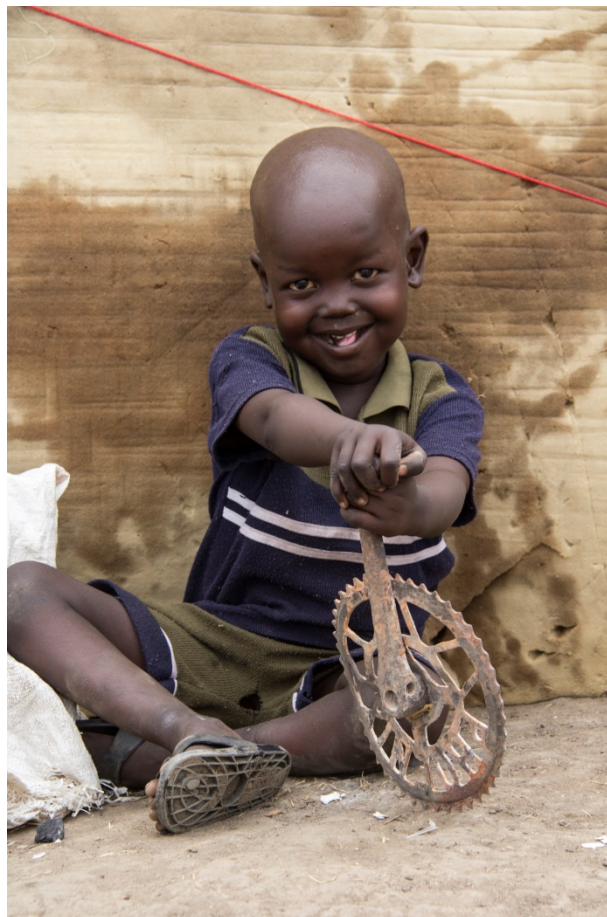
Displaced boy at the UN mission near Juba airport.