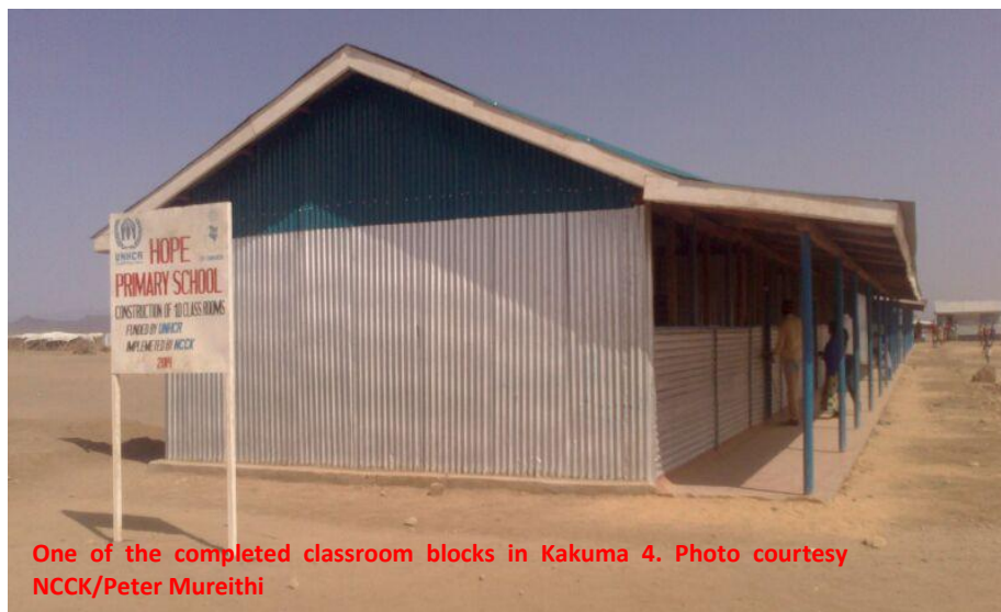
One of the completed classroom blocks in Kakuma 4.

NCCCK has completed construction of 10 semi-permanent classrooms in Kakuma 4.