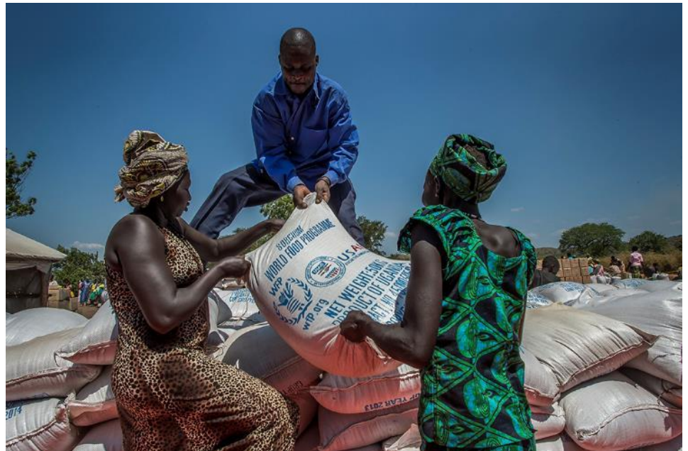
General WFP food distribution to all refugees in Nyumanzi settlement, Adjumani.

(pending any carry-over of funds from 2014)