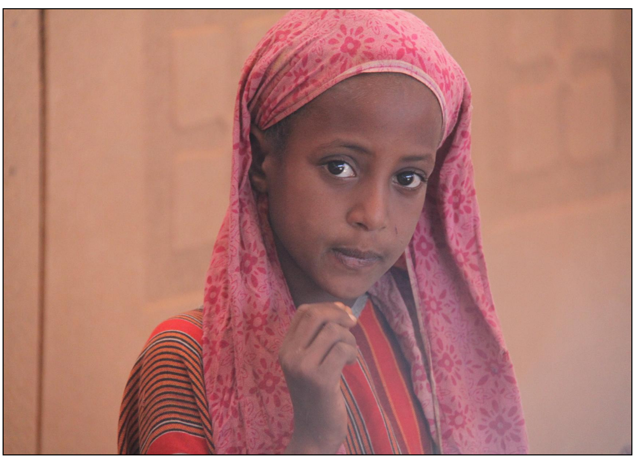
Children under the age of 18 represent almost 81% of the refugee population in the Dollo Ado camps.