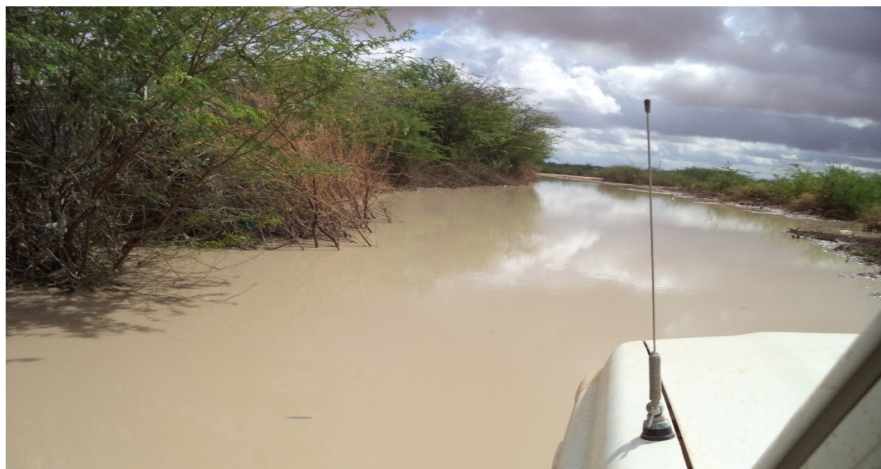
A road in Ifo camp 11/11/2013

With the onset of the short rains, roads were flooded, forcing refugees to wade through water in order to reach some essential services. There was a risk of outbreaks of water-borne diseases as children were swimming in the pools of stagnant water and latrines were flowing over in some places. However, the situation had improved compared to previous years because of preventive measures, such as canalisation and building of dams.