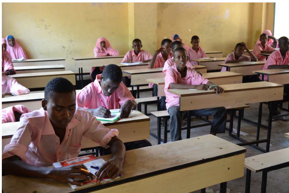
Undugu primary school, Hagadera 06/11/2013

Schoolchildren in the camps were preparing for the final exams taking place in the second half of November. School holidays were scheduled to start on 22 November.