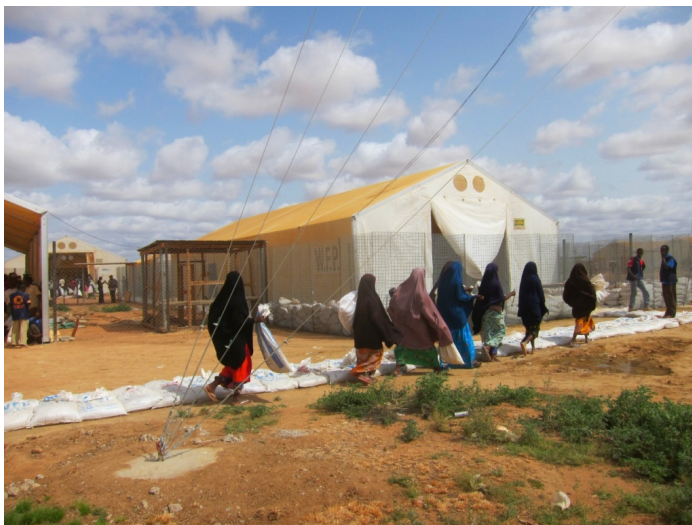
Refugees at a food distribution point

The new food collection procedures using biometrics were running in all refugee camps of Kenya as part of the normal food distribution. In all seven food distribution centres in Kakuma and Dadaab, the fingerprints of beneficiaries were being checked before they were collecting their food assistance. A small number were being rejected or referred to the UNHCR Field Offices, and a significant number of cards had stopped being used. Overall, WFP was distributing 58,000 fewer rations since the system was introduced, with UNHCR and WFP working side-by-side to guarantee that nobody entitled to it was denied food assistance, while simultaneously improving the efficiency of the food distribution process.