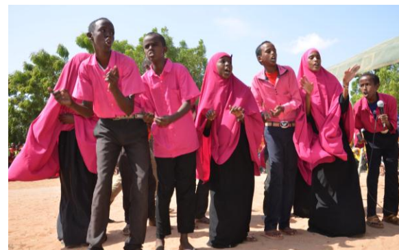
Music, dances and football in camps and Dadaab town