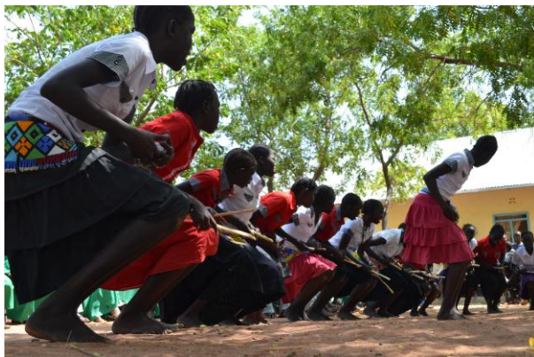
Spectators in Ifo camp