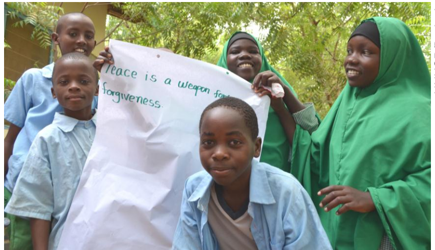
Refugees in Ifo and Dagahaley camps showing their peace messages in preparation of World Refugee Day 2014

The local radio stations Star FM and Dadaab FM also put an emphasis on peace topics in their shows and interaction with the refugee community.