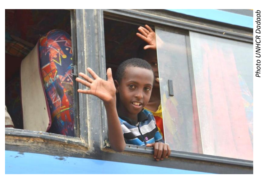
Young refugee returning to Somalia with his family

Contacts: UNHCR Dadaab Protection Unit UNHCR Dadaab External Relations Unit, kendapi@unhcr.org, Cell +254 704381822