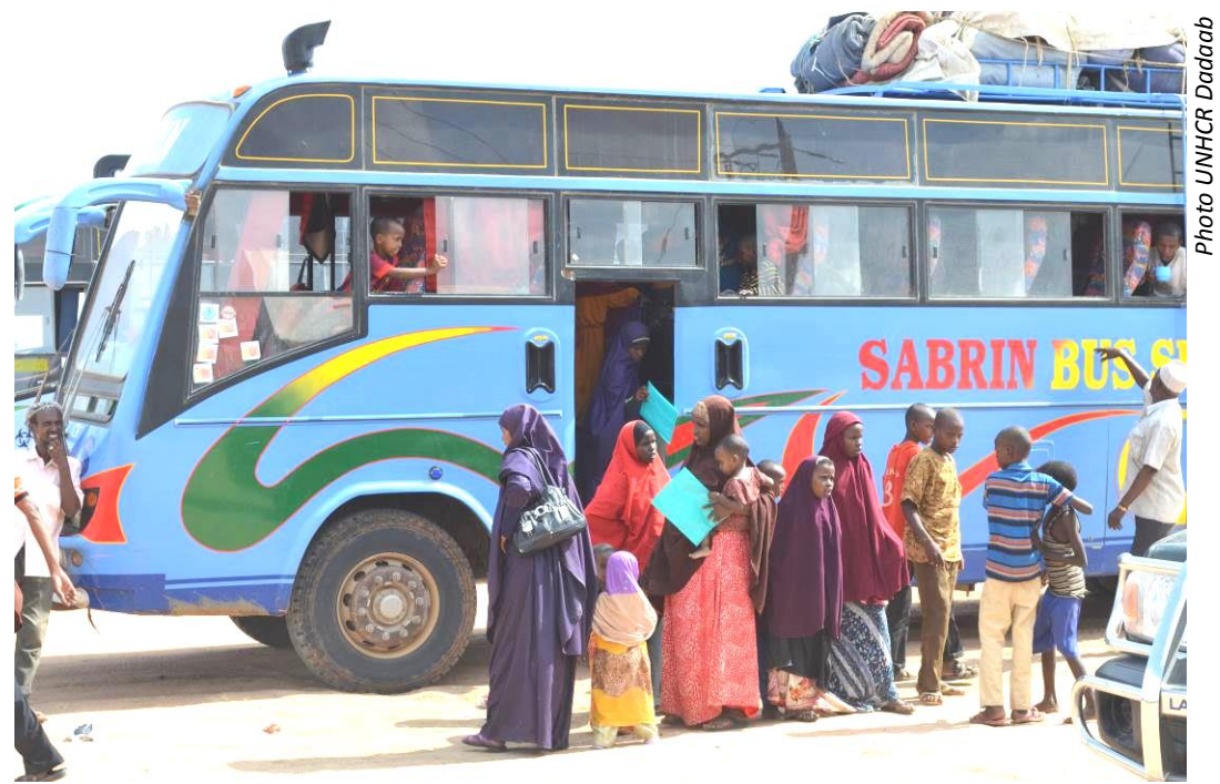
Families prepare for their departure from Dadaab

The current population in the Dadaab refugee camps is 353,590 persons of concern (of which 336,695 are refugees from Somalia). At the height of the humanitarian crisis in 2011 the population had increased to 486,913 persons of concern. Since then the population has decreased by 133,323 persons of concern. It is important to note that during the course of 2014 alone there was a general population decrease of 52,269.