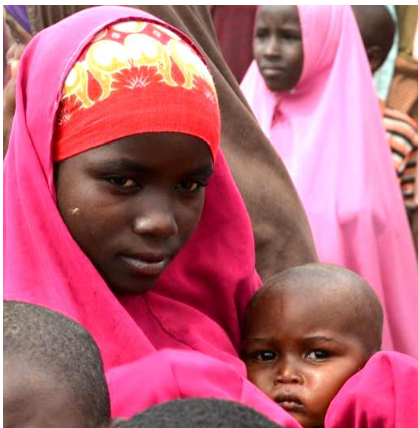
Girl and baby in Ifo 2 Camp

The data collection carried out in Dadaab in 2014 built on previous studies conducted in other locations. The research results add to the growing evidence base on scope and severity of IPV in humanitarian settings.