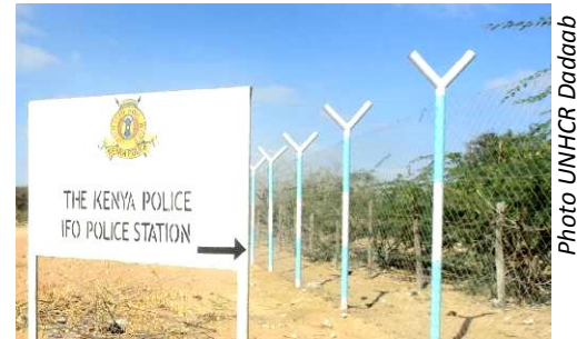
New fence around Ifo police station