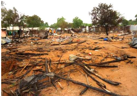
Hagadera section D 3 after the fire

A KRCS Fire Response Unit was established in September 2014 with UNHCR’s support. Dadaab camps have in the past experienced fires that resulted in destruction of property especially in markets and residential areas. The unit is composed of one fire station officer, 35 fire wardens and a fully equipped fire truck engine. It seeks to ensure that all fire emergency cases in the camps are responded to in a timely manner.