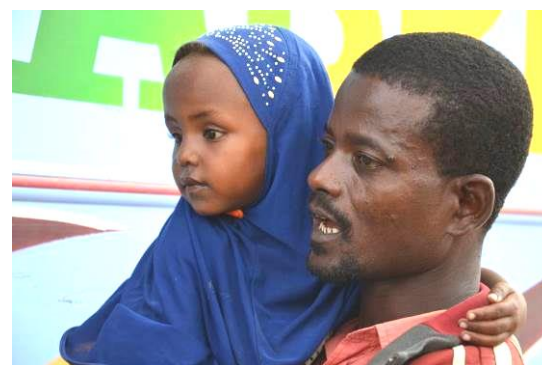
Families get ready for the bus to Somalia