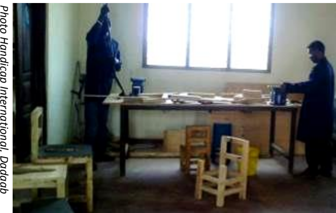
Production of positioning aids for children with disabilities