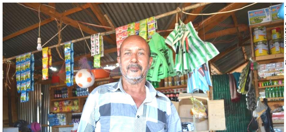
One of the few shop owners in Kambioos camp

Currently, there are only few shops in Kambioos camp and refugees travel over 6km to Hagadera camp to buy essential commodities.