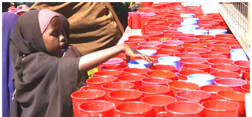
Dadaab