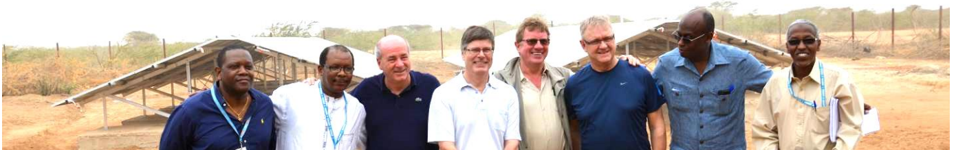
Visitors and UNHCR staff after the commissioning of the solar-diesel hybrid system in Ifo camp