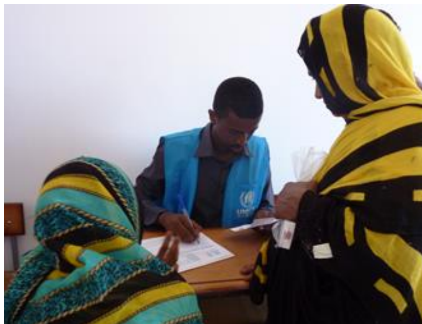
Together with the government entity responsible for refugees, (ONARS), UNHCR registers newly arrived refugees at Obock, Djibouti.