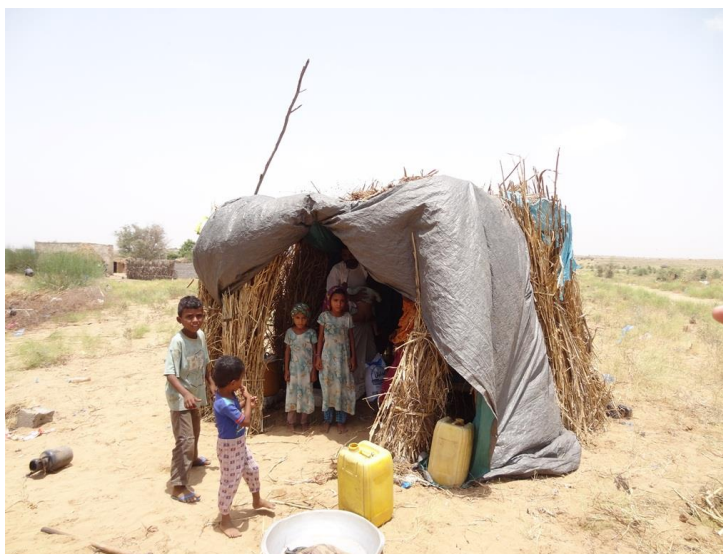
Families now live in open air in Abs district of Hajjah governorate, Yemen, after fleeing Mazraq camp for displaced people as a result of conflict.

Strikes, shelling, and fighting have affected civilian infrastructures with inevitable consequences. The severe shortage of fuel is increasingly having a detrimental effect on communications as internet and mobile companies indicate they may be unable to maintain services for much longer. The lack of electricity and fuel, domestic gas and basic commodities has become acute and is affecting all persons of concern to UNHCR as well as humanitarian actors' capacity to operate. Most of UNHCR international staff members are working remotely and have not left their homes for many days. Lack of fuel also restricts UNHCR's partners' patrolling activities, such as the Yemen Red Crescent at Bab Al Mandab. This will adversely impact the capacity to carry out of life-saving interventions and to monitor and register new arrivals on Yemen's coasts.