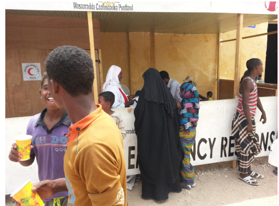
Save the Children and Somali Red Crescent Society providing cold milk and medical care to new arrivals in Bossaso Reception Center on 13 June 2015

DRC supported 200 individuals. Save the Children International (SCI) provided onward transportation to 93 persons. Cumulatively, the Puntland New Arrivals Task Force members supported 2,931 individuals with onward transportation. IOM has also supported 32 Third Country Nationals (TCNs) with arrangement of travel documents and onward transport.