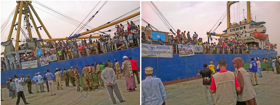
Arrival of Nawal cargo ship, carrying 2,019 people fleeing Yemen, at Bossaso Port on 13 June 2015

New Arrivals | During the reporting period, three boats arrived in Bossaso, on 13 June. The first boat was named Faxtul Kheyr and carried 9 people in total (3 females, 2 males and 4 children). The second boat was named Shamis and carried 75 people in total (22 females, 19 males and 34 children). The third boat was named Nawal and contained 2,019 people in total (633 females, 445 males and 941 children). Among the new arrivals there were 1,873 Somali nationals, 220 Yemenis and 10 Ethiopians.