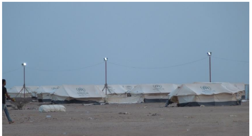
Markazi Refugee Camp, Djibouti – Thanks to the Arrahma Association, refugees enjoy bright evenings.