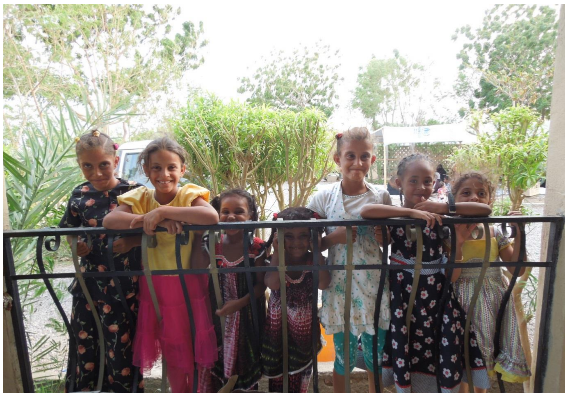
Refugee children in UNHCR's compound, where they were given temporary shelter when violent sandstorms damaged Markazi refugee camp in Obock, Djibouti. ©UNHCR/S.Malaguti, 18 July 2015.