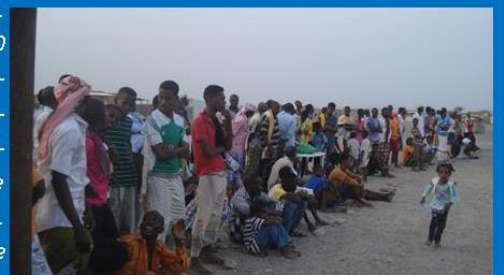
Bystanders watching the last game of the Champions Football Club

During the Holy Month of Ramadan, UNHCR's partner InterSos spear-headed several activities for the refugee community in Kharaz refugee camp in Yemen. One of the most popular activities was the formation of a Champions Football Club. Refugees of all ages came together for a match, cherishing the opportunity to have fun and forget the stress they face with the insecurity, scarce basic services and lack of livelihood opportunities. UNHCR and partners have had little access to the refugee camp and providing lifesaving aid to the camp has been extremely difficult.