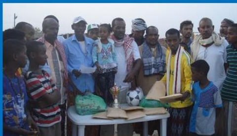
Award ceremony for the Sports Committee @Intersos

Kharaz refugee camp, located in Lahj governorate was opened in 2000 and hosts some 20,000 refugees, mainly from the Horn of Africa. Inter-Sos continues to be active in the camp, providing respite through positive activities such as the Football club and providing counselling consultations. On 25 July, Intersos marked the final game with a grand finale of thanks and certificates given to the hard working sport committee. On that day, refugees at Kharaz camp had the opportunity to escape the realities of the on-going conflict.