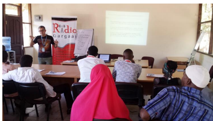
UNHCR trained camp journalists on refugees' rights and UNHCR's protection mandate