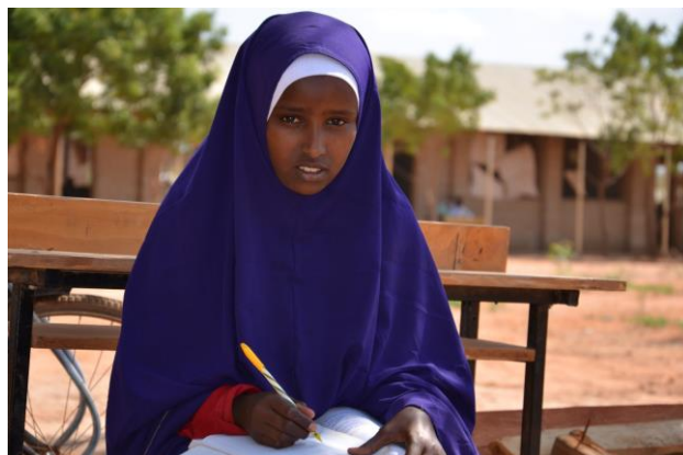
A student from Hormud primary school in Ifo camp