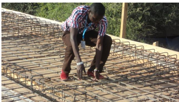
UNHCR construction work response to the critical needs in the camps