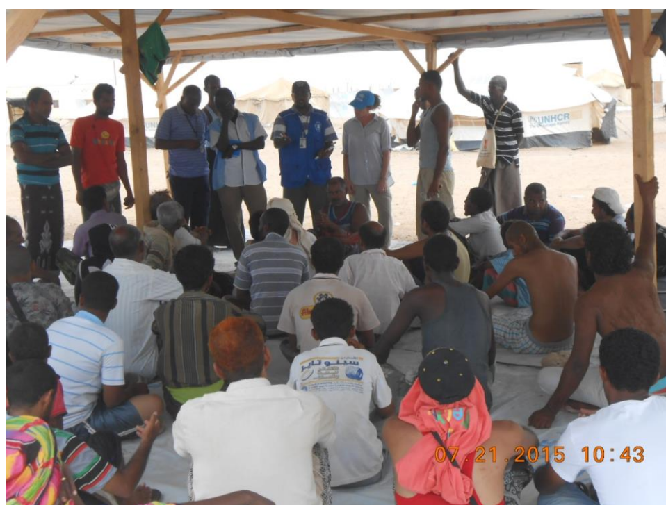
WFP, UNHCR and ONARS staff conduct awareness campaigns in Markazi to explain WFP mandate and food-related issues, August 2015.