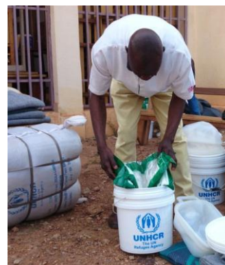
Non-food items will be distributed to all Sudanese refugees living in Bangui, CAR.