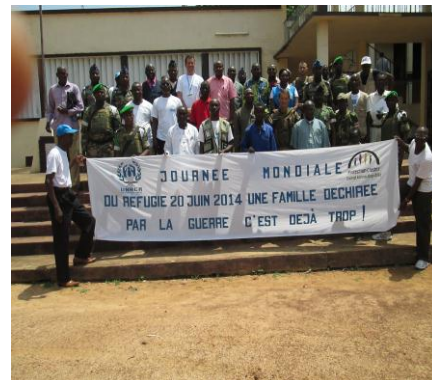
Some 36 persons, including Gendarmerie and Police forces, Sangaris and MISCA elements attended a workshop provided by UNHCR team. Participants were trained on International Protection, UNHCR mandate, and interventions of the sub-cluster.