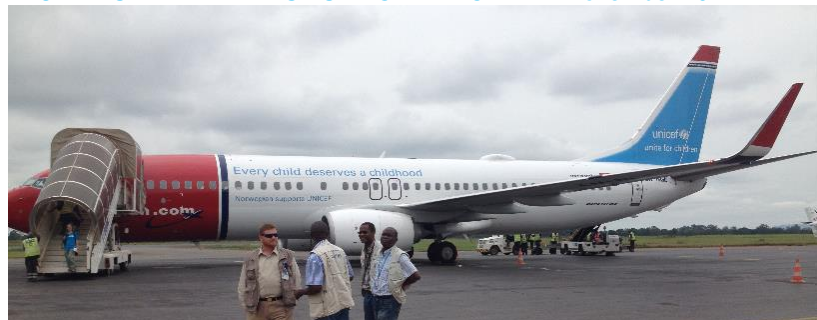
Offloading of cargo from Norwegian Air - "Fill up a plane" UNICEF Norway campaign