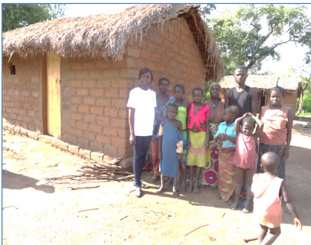
Reconstructed shelter in Bozoum/UNHCR Paoua/Sept 2014