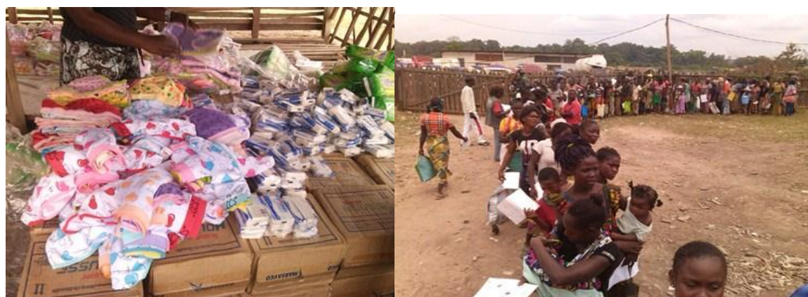
DISTRIBUTION OF HYGIENIC KITS TO CAR REFUGEES WOMEN AND GIRLS, BETOU/AUGUS 11, 2015