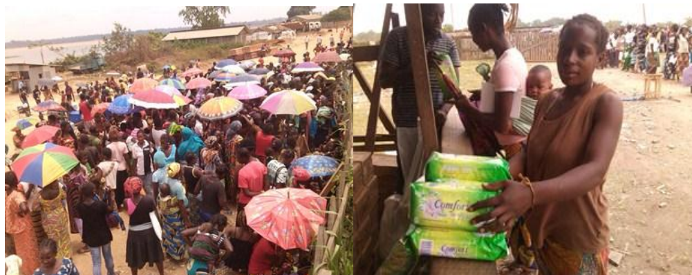
DISTRIBUTION OF HYGIENIC KITS TO CAR REFUGEES WOMEN AND GIRLS, BETOU/AUGUST 11, 2015