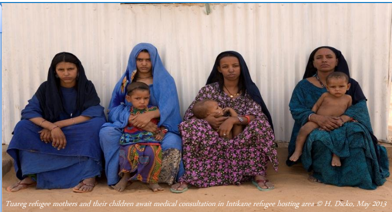
Tuareg refugee mothers and their children await medical consultation in Intikane refugee hosting area © H. Dicko, May 2013