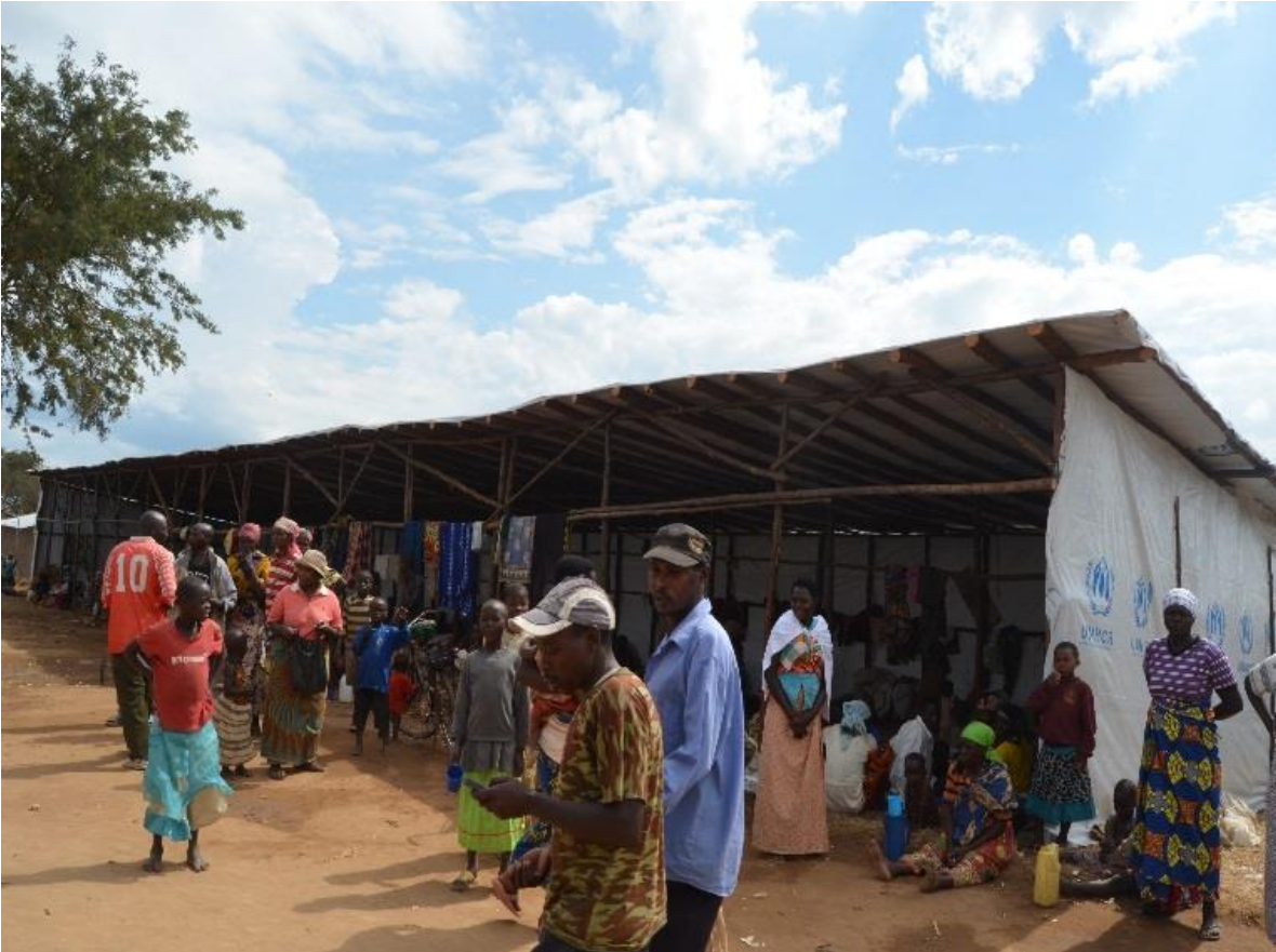
Emergency structure for the Burundians built by UNHCR at Kabazana Reception Centre in Nakivale.