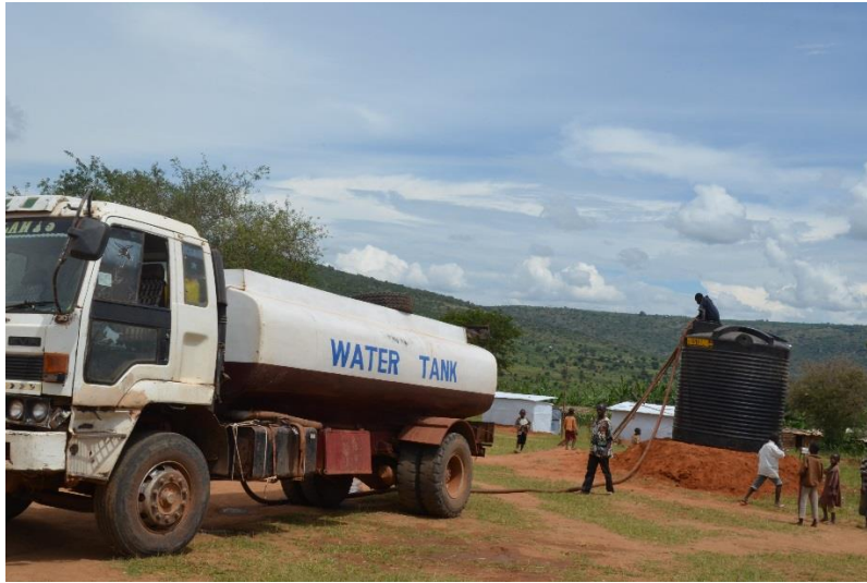
Water Trucking in Kabinda C village.