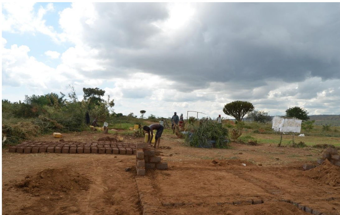
Burundian refugees' construction activities at Kashojwa B village in Nakivale.