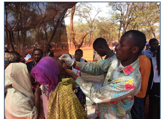
Nyarugusu, cholera vaccination campaign, June 2015