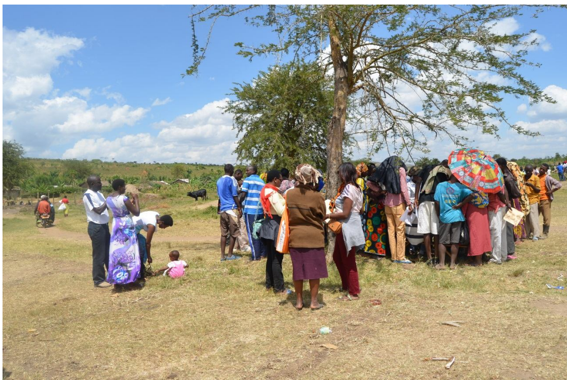
Burundian refugees at Misiera village, undergoing OPM verification before receiving poles to construct their houses .