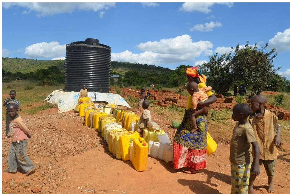
Burundian refugees queuing for water at Kabahinda C village, Nakivale.