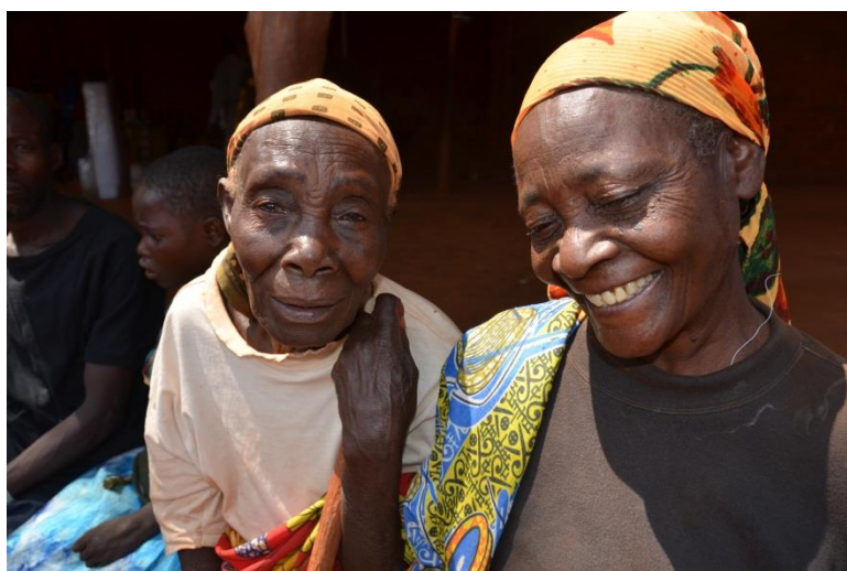
The Elderly, while waiting to receive nonfood items at the distribution centre in Nyarugusu