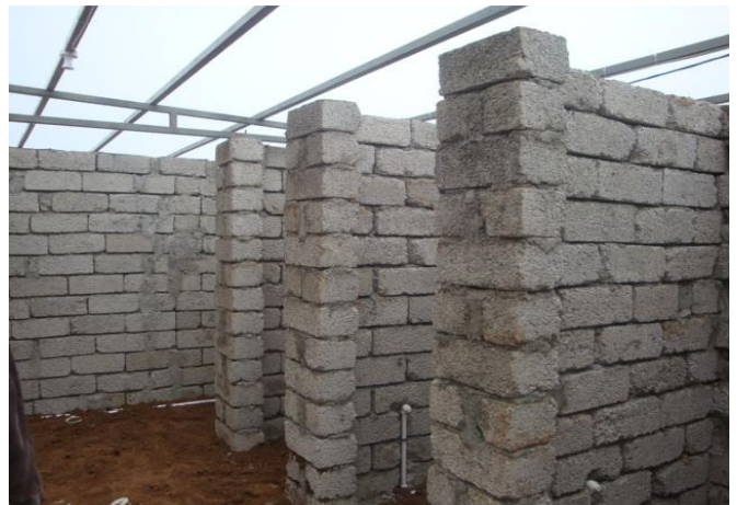
Latrines implemented by UNHCR IP Qandil