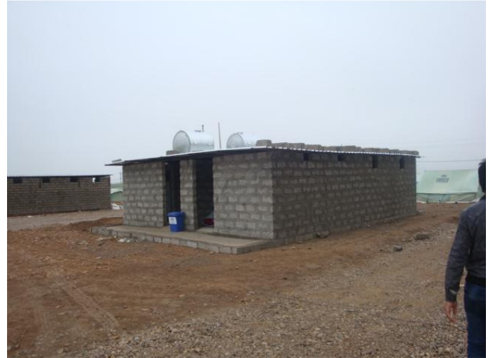
Latrines implemented by DDM

Every tent has a galvanized steel tank (1000 liter) placed on blocks. The tank is filled with water on a daily basis by LA tankers to ensure that the refugees have access for sufficient quantity of clean water for drinking, cooking and washing (ration 7.5-15 l/person/day).