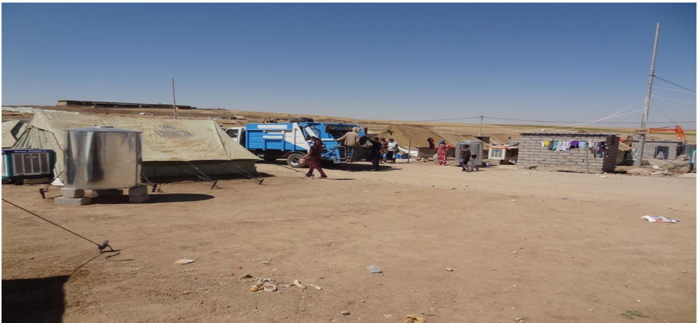
Garbage collection in the camp

In addition to the regular garbage collection in Domiz camp by Fayda Municipality, UNHCR through Qandil hired one tractor and 8 workers among the Syrian new arrivals to remove solid items and garbage in internal roads, open spaces and the surrounding areas of Domiz camp.