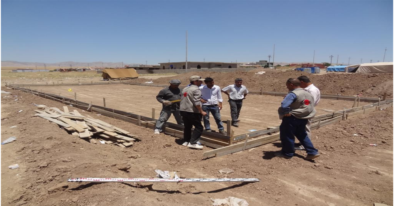
Laying the foundation of new tents

Some 7 rechargeable fans were distributed to 7 vulnerable families identified by UNHCR Community Service team. Two big tents have been installed in the Administration part of the camp and used as a waiting area for persons pending registration. The two tents were provided with 40 plastic chairs, 12 pieces of plastic mat and one air cooler. Tendering for the construction of 48 plots in phase 2 A, 48 plots in phase 2 B and 48 plots in phase 2 C for the families sector was completed. Similarly, for the construction of 44 plots for the singles' site in phase 2 and additional services in phase 1 that includes cooking areas, baths and latrines as well as closed sanitation.