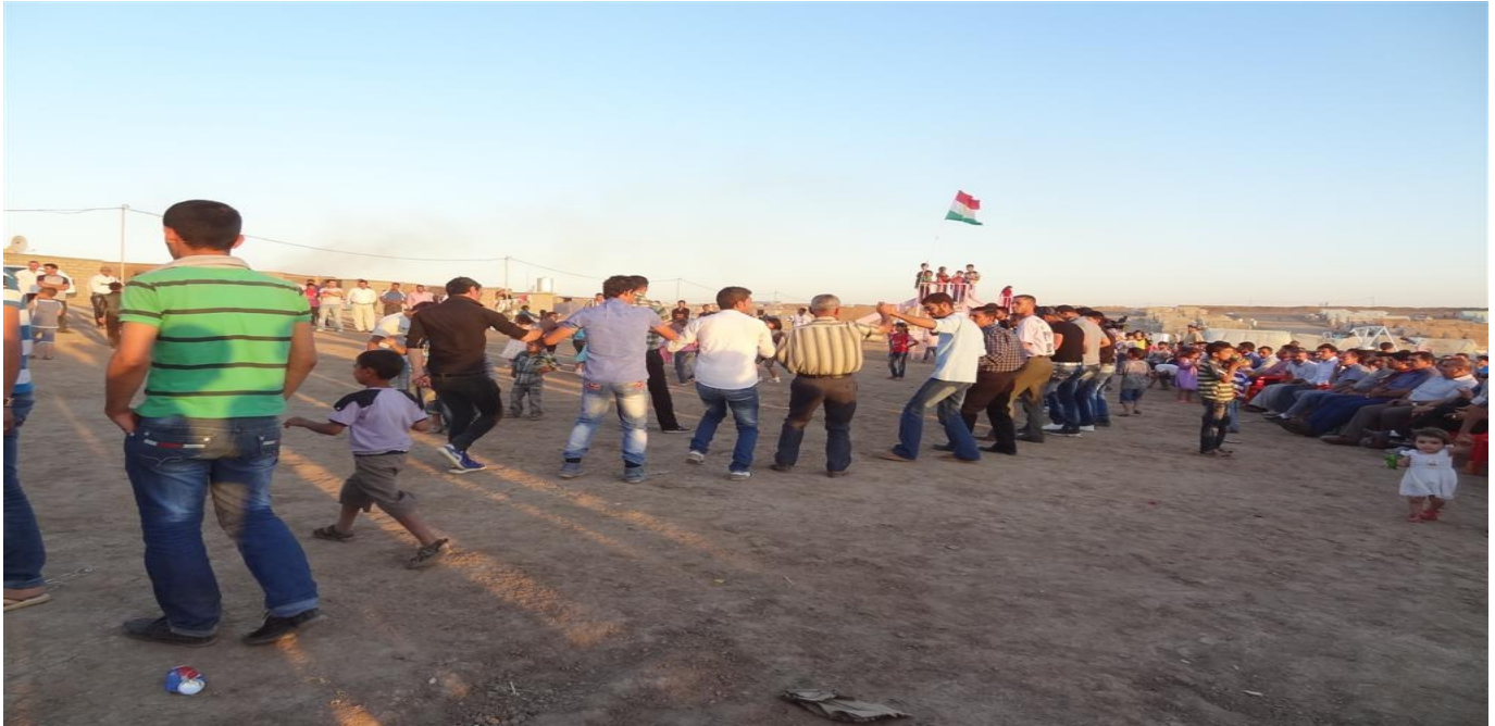
Celebrating the World Refugee Day