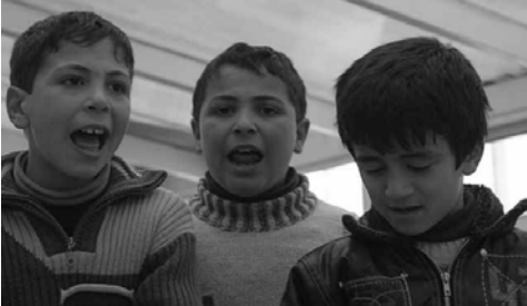
School kit distributed to children registered with UNHCR upon registration with a public school

UNICEF continues to assist vulnerable Syrian children with psychosocial and remedial education in the Ramtha Facility and in Ma'an. To date, UNICEF has supported 120 vulnerable Syrian children in the Ramtha Facility while 180 Syrian children are receiving similar assistance in Ma'an.