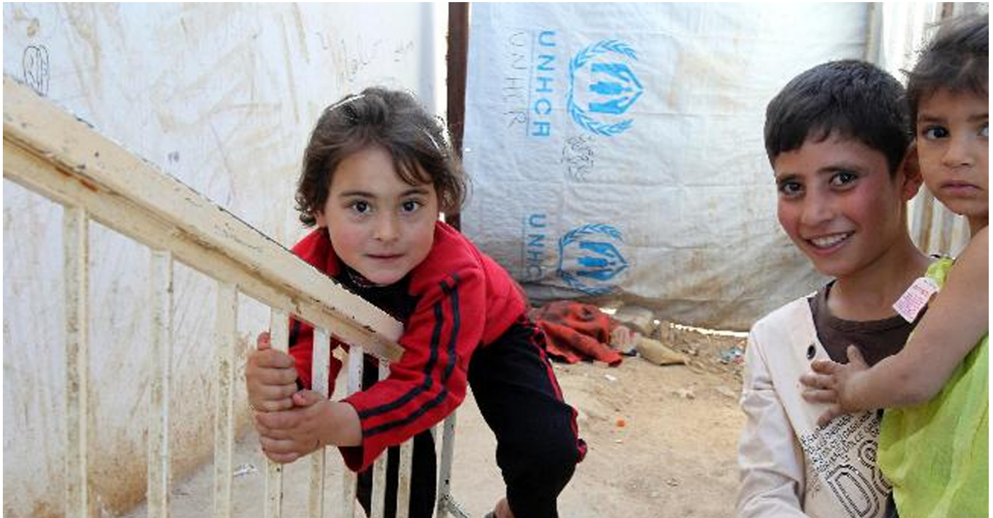
Syrian refugee children play near their temporary home in the Jordanian city of Al Ramtha, near the Syrian border.