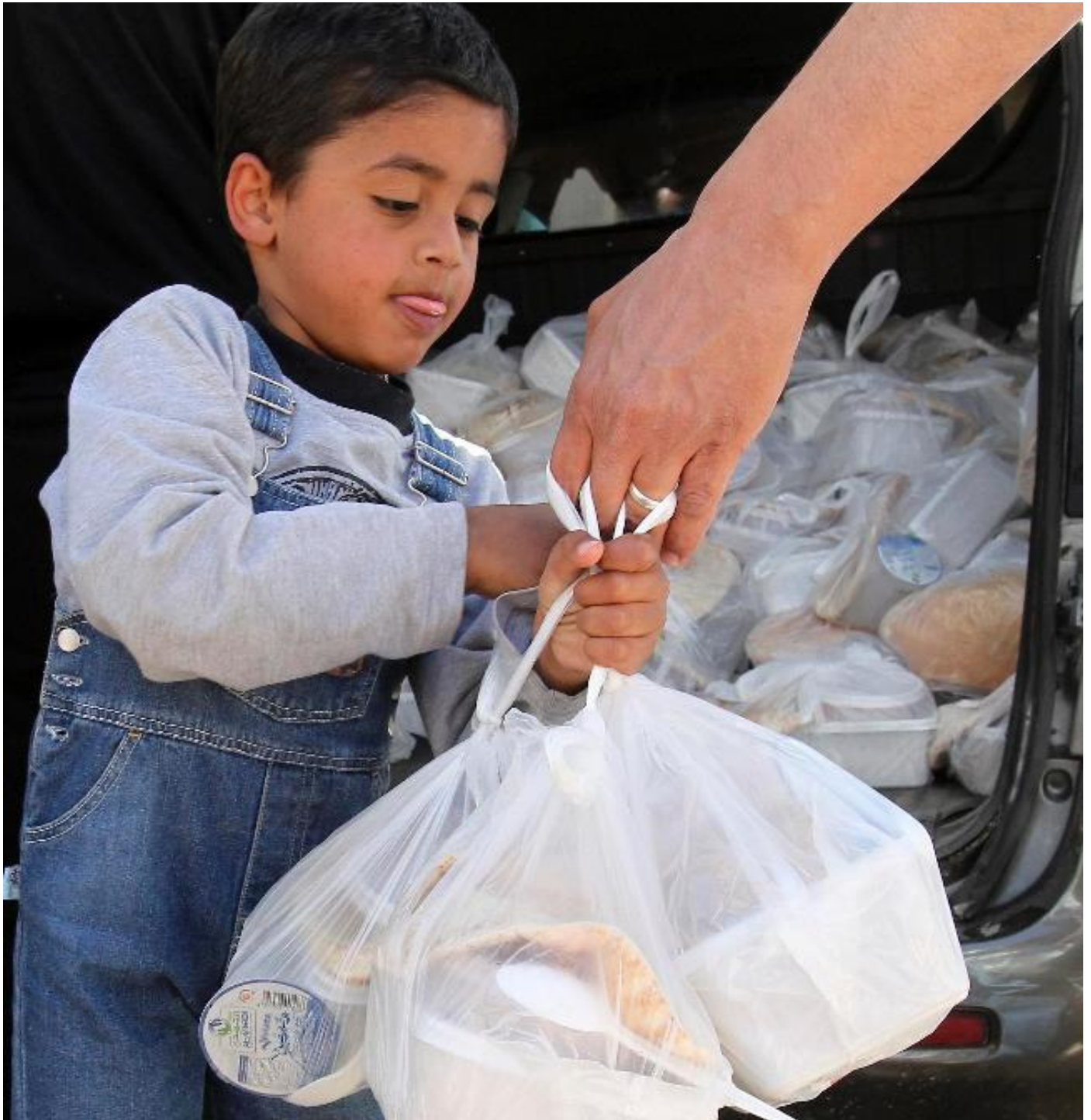
A Syrian refugee child receives a meal from the U.N. World Food Programme at his temporary home in the Jordanian city of Al Ramtha, near the Syrian border.