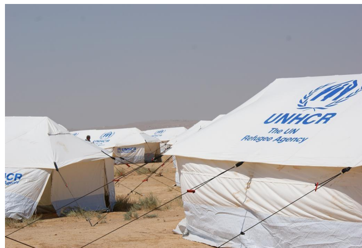
@ UNHCR Jordan / 2012