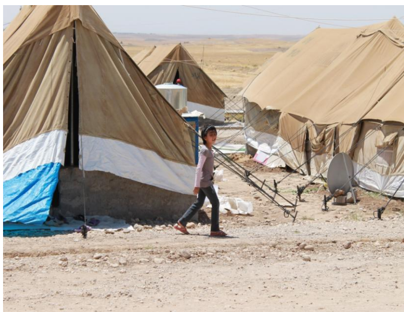
Refugee Camp in Iraq

This weekly update provides a snapshot of the United Nations and partners' response to the influx of Syrian refugees into Jordan, Lebanon, Iraq and Turkey. The response is led by the UN Refugee Agency and is undertaken in full coordination with host Governments, UN agencies, and NGO partners. This report covers the period from 20 to 27 July 2012. The next update will be issued on 3 August 2012.