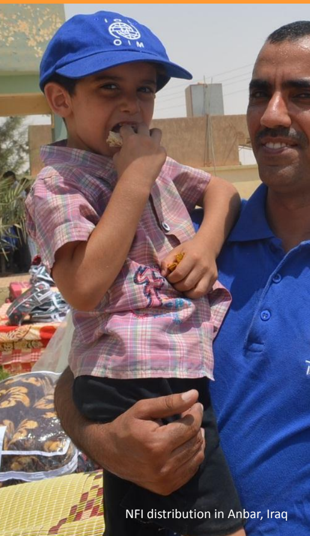
NFI distribution in Anbar, Iraq

This report is produced by the International Organization for Migration (IOM) on its humanitarian response to the effects of the crisis in Syria. The summary covers events and activities between 27 July and 3 August.