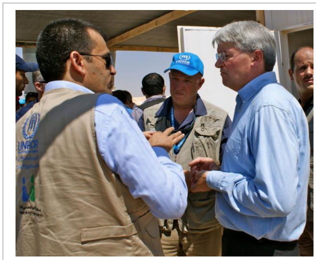
At the Za'atri Camp in Jordan