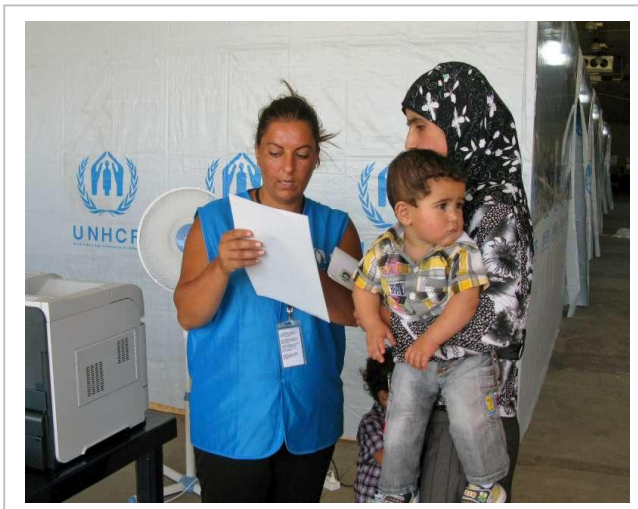
Syrian Refugees being processed at the new UNHCR registration center in Tripoli