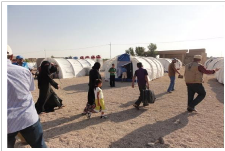
Syrian New arrivals in Al-Qaim camp