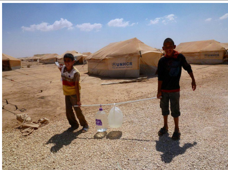
Syrian refugee children at the Za'atri camp in Jordan