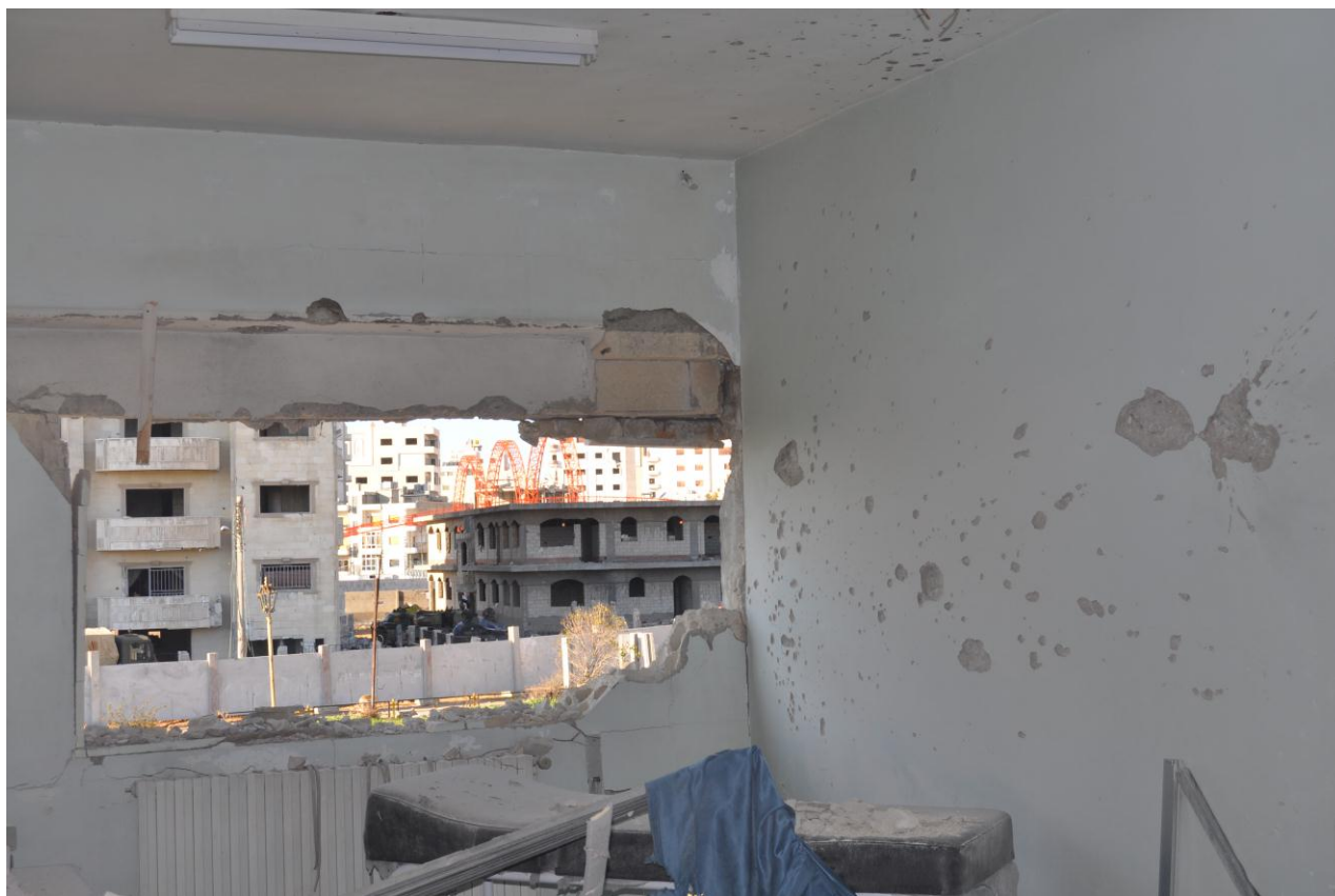
38 out of 88 hospitals have been damaged