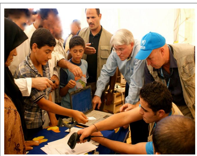
UNHCR introduced an emergency registration system at the Za'atri camp in Jordan