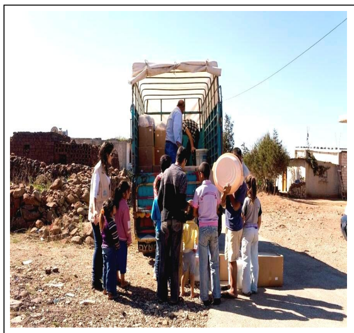
Non-food items being distributed in Lebanon

This weekly update provides a snapshot of the United Nations and partners' response to the influx of Syrian refugees into Jordan, Lebanon, Iraq and Turkey. The response is led by the UN Refugee Agency and is undertaken in full coordination with host Governments, UN agencies, and NGO partners. This report covers the period from 25 to 31 August 2012. The next update will be issued on 7 September 2012.