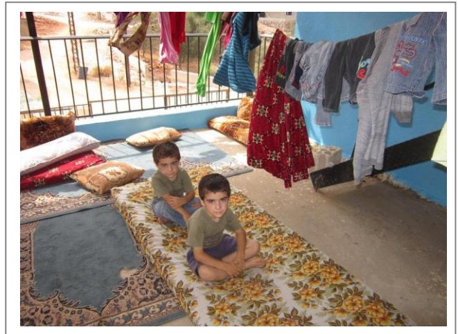
Syrian refugees are largely being hosted by the local community in Lebanon