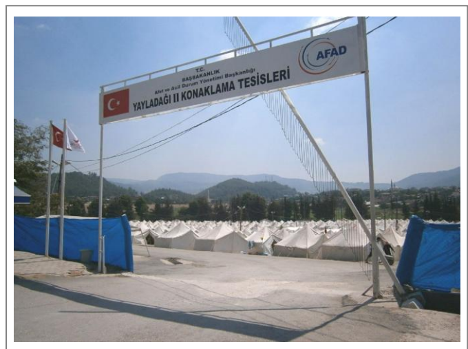
Yayladag camp in Turkey