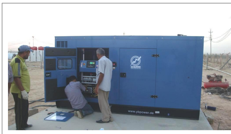
A generator being installed in Al-Qaim camp