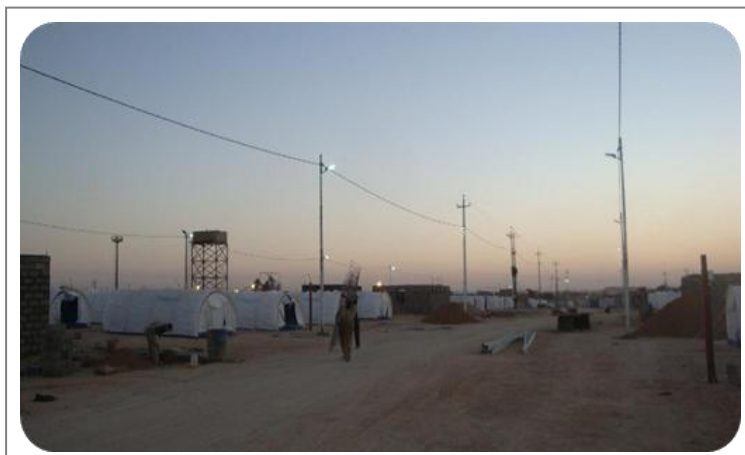
One side of Al-Qaim refugee camp