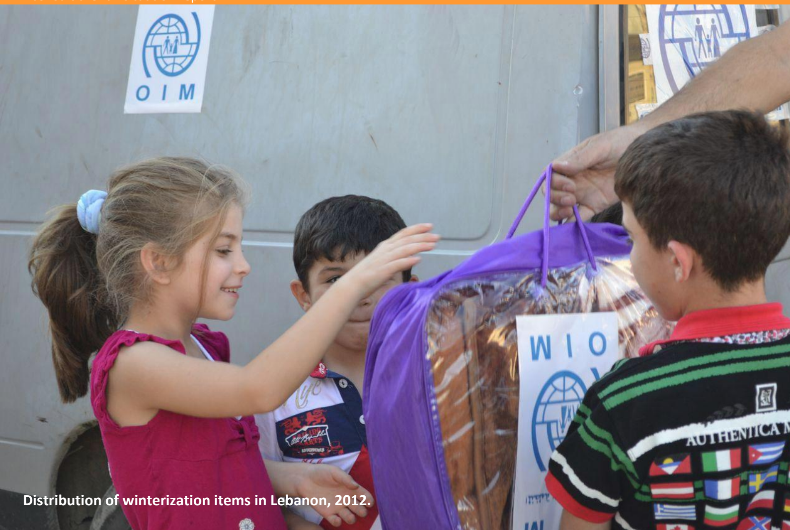
Distribution of winterization items in Lebanon, 2012.

This report is produced by the International Organization for Migration (IOM) on its humanitarian response for the crisis in Syria. The summary covers events and activities until 12 September. For activities implemented in Syria, please consult the full situation report.