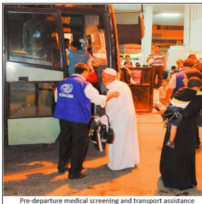
Pre-departure medical screening and transport assistance