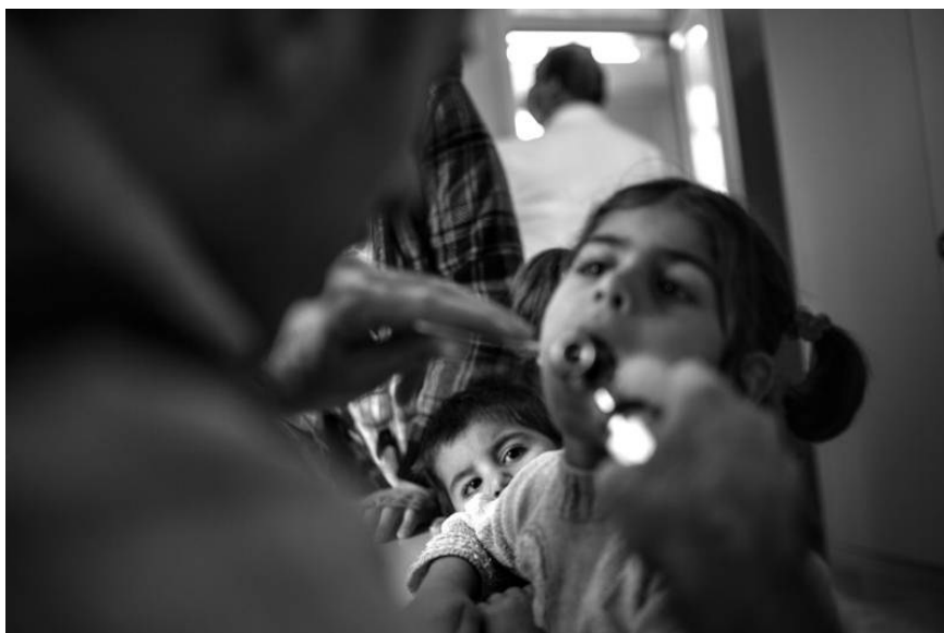
A doctor examines a sick Syrian refugee girl while her younger brother looks on at a health clinic in Domiz Refugee Camp in the Kurdistan Region, Iraq.