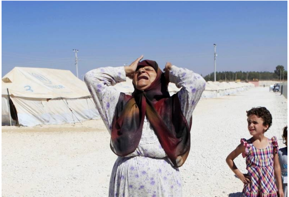
An elderly Syrian woman becomes emotional when talking about Syria and her new life as a refugee in the Akcakale camp, southern Turkey, which provides shelter to almost 10,000 Syrian refugees.