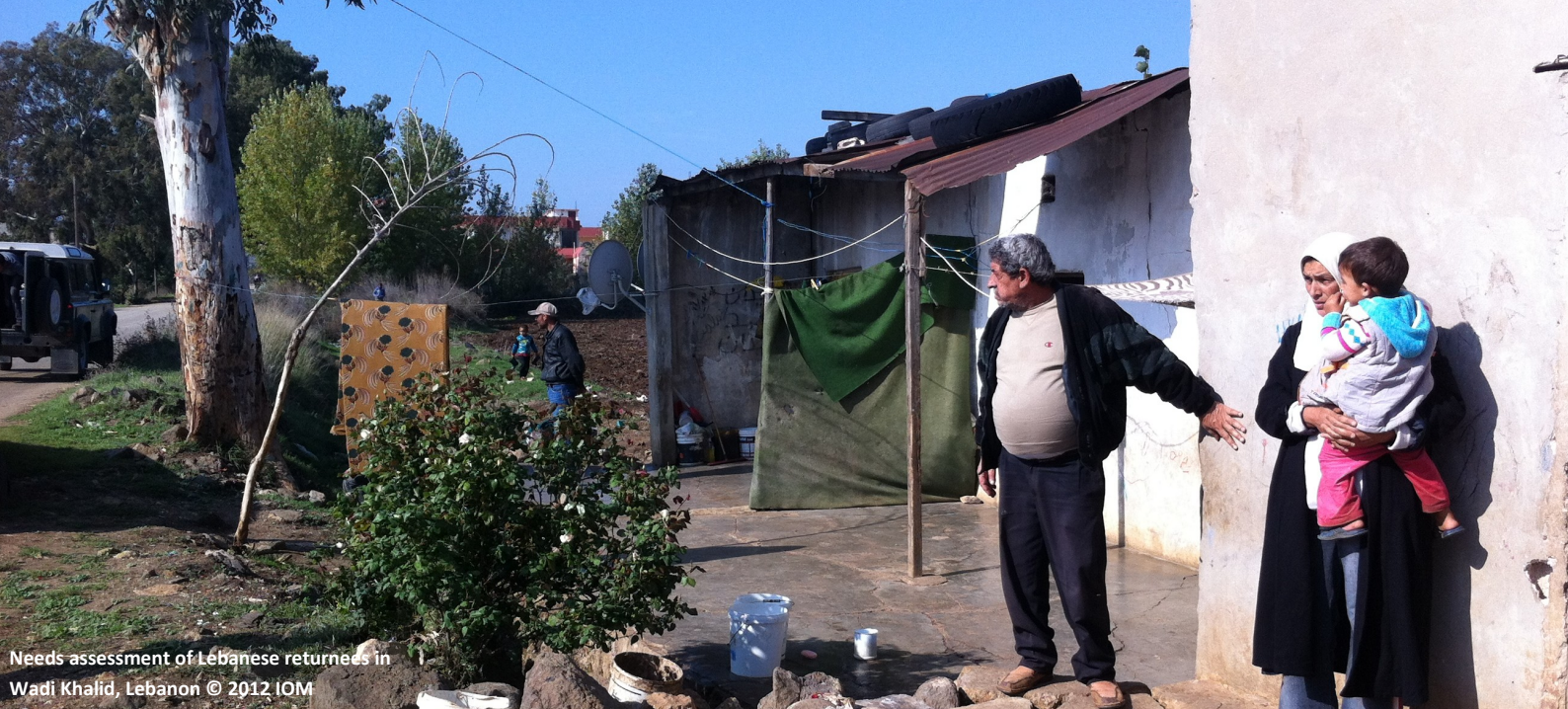
Needs assessment of Lebanese returnees in Wadi Khalid, Lebanon © 2012 IOM