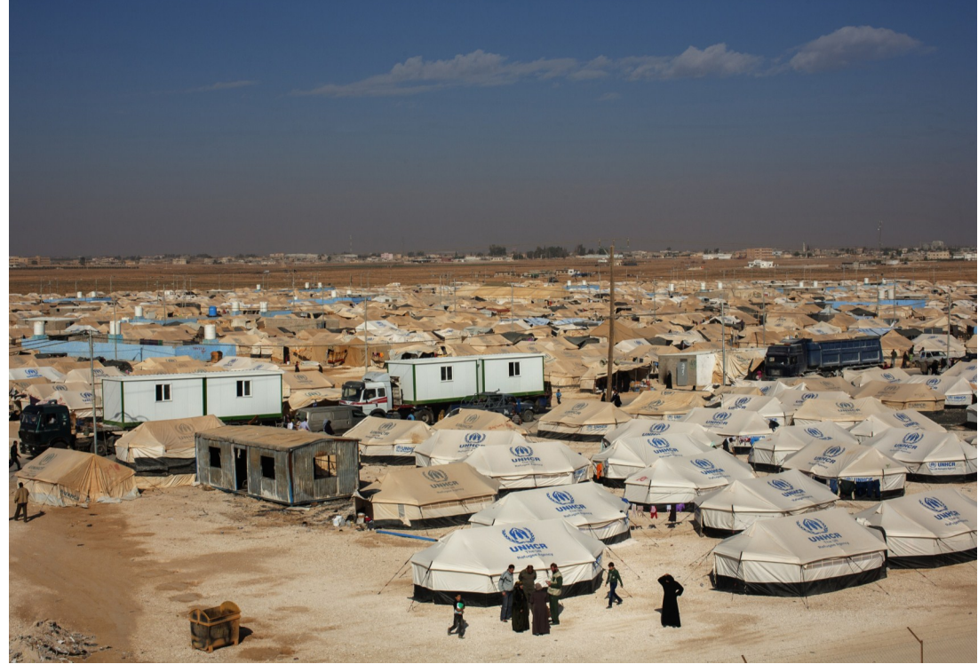
Trucks pull pre-fabricated homes (caravans) through the centre of Za'atri camp. UNHCR is working to relocate refugee families to these homes, which provide better protection and insulation.

♦ an insecure living environment, in which vulnerable groups may face serious protection risks without recourse to the Jordanian justice system.