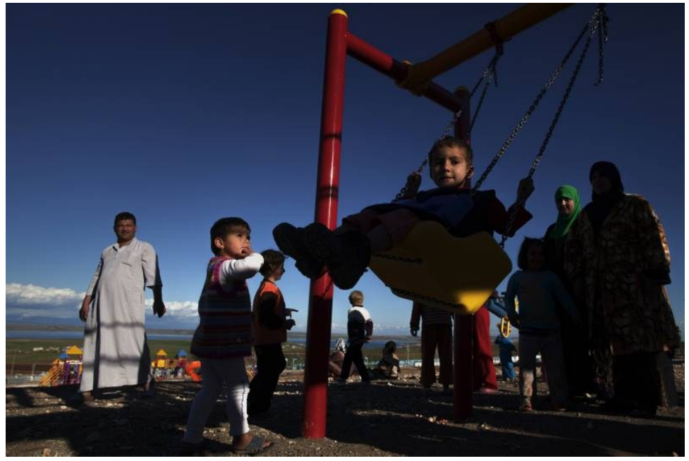
A Syrian child plays on a swing in a playground area established in Adiyaman refugee camp, Turkey. The services provided at the camp addresses both the physical and psychosocial needs of refugees.

• <u>Iraq</u> - A child protection remote assessment was completed as part of a broader regional assessment that aims to gather valuable information on the child protection situation inside Syria. In total, 181 Syrians were interviewed from within Domiz camp and the host community. The data collected will now be compiled with that collected from Jordan and Lebanon. UNHCR led a two-day training on Best Interest Determination (BID), which resulted in an action plan for the implementation of the BID Standard Operating Procedures. A panel was