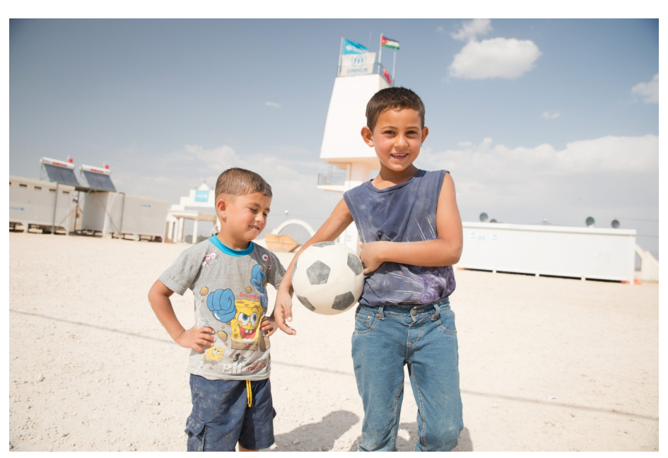
Young refugees play in an open area in King Abdullah Park, Jordan.

• Turkey - The Turkish Red Crescent (TRC) with the support of UNICEF have completed orientation and training for 20 youth and recreation workers who have been deployed to 14 camps accommodating Syrian refugees across the country. The training - the first in a series to be carried out over the course of the 18 month programme - was also attended by ten social workers from the Ministry of Family and Social Policy who are already working in the camps. The new youth and recreation workers will mobilize youth volunteers and plan and implement recreational activities for young refugees, targeting 10,000 refugees aged four to 18 years old.