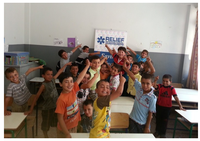
Young refugees in north Lebanon.