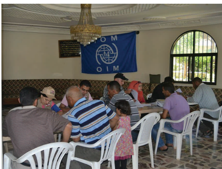
From 18 to 26 July, 577 Lebanese returnee households were registered in Wadi Khaled.

A total of 7,295 Lebanese returnees were registered as of July 26