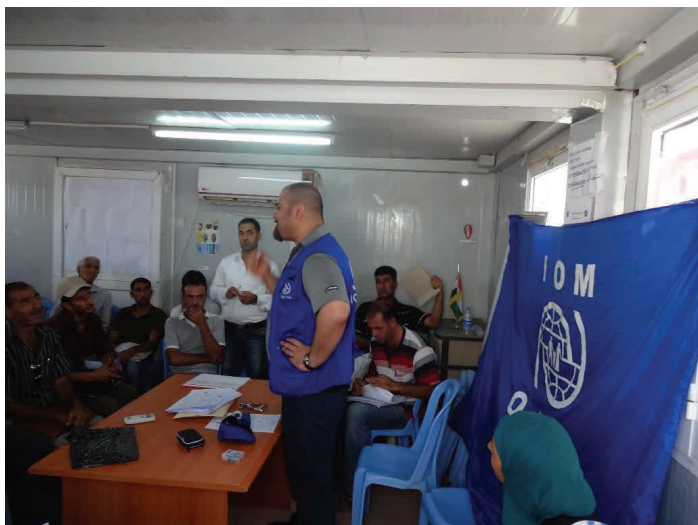
IOM staff providing training to community leaders on fire prevention and fire safety in Domiz camp.

Non-Food Item Distribution: From 21 to 24 July, IOM distributed 633 NFI kits to 3,044 Syrian refugees living in Domiz camp.