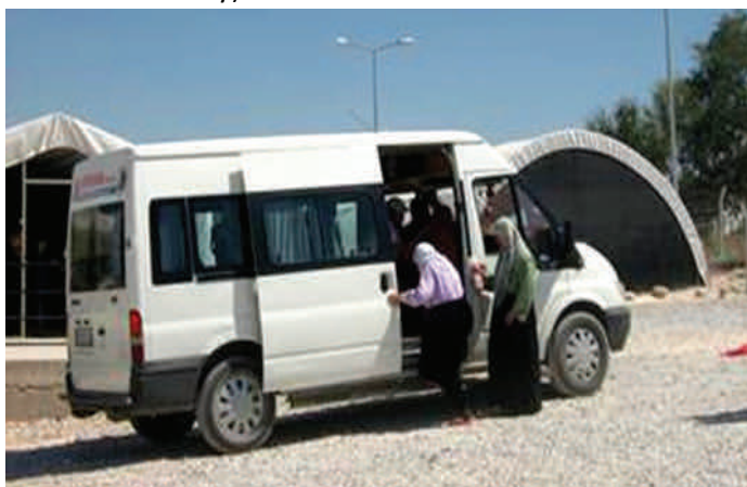
Above: From 22 to 28 July, 663 residents of Adiyaman camp were assisted by IOM and camp management to reach medical centers and markets in Adiyaman city.

While there are health facilities provided at the camp, the transportation service is provided for beneficiaries that may require blood tests, X-rays, gynecological consultations and other specialized services. For beneficiaries with chronic conditions who require specialized treatment not available in Adiyaman province, transport is provided to Gaziantep, Adana, and Maltya hospitals ( 43 beneficiaries were referred for specialized treatment since 1 July).