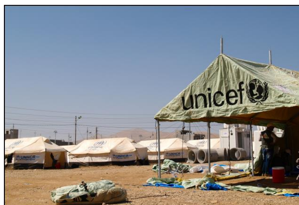
The new CFS space in Arbat.

Two tents for child protection activities were received and will be erected on 29 August. The first