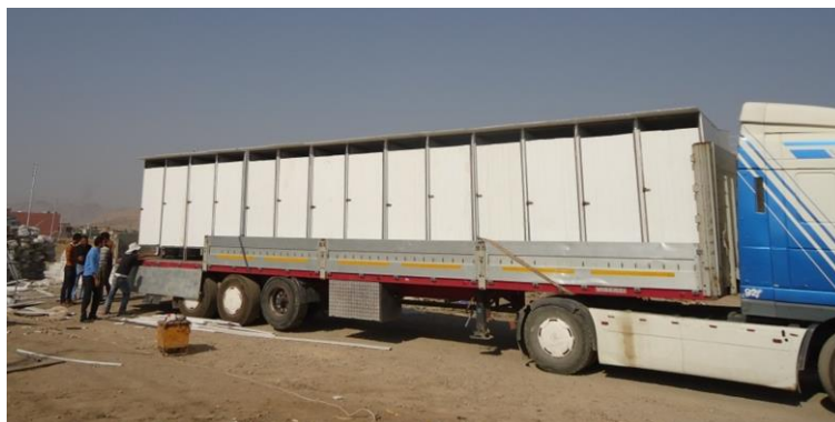
Latrines loaded for delivery to Kawrgosk

Twenty five latrines arrived on 28 August and another 25 will arrive on 29 August. In addition, 4x30m 3 onion tanks have been ordered from Copenhagen and will arrive with the first shipment this week. Two additional 45,000L tanks will follow soon thereafter.