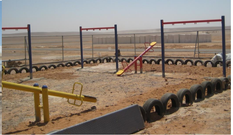
Azraq camp playground, ©MC/Jordan 2013/Buryan

Education The school year began on 1 September in Schools I and III in Za'atari as well as the EJC School. In Za'atari schools, an Open House event was held for the first several days, featuring a variety of activities including music, drawing, henna, story writing, games and awareness sessions along with registration of new students. On 8 September, formal classes begin in Za'atari Schools I and III and EJC.