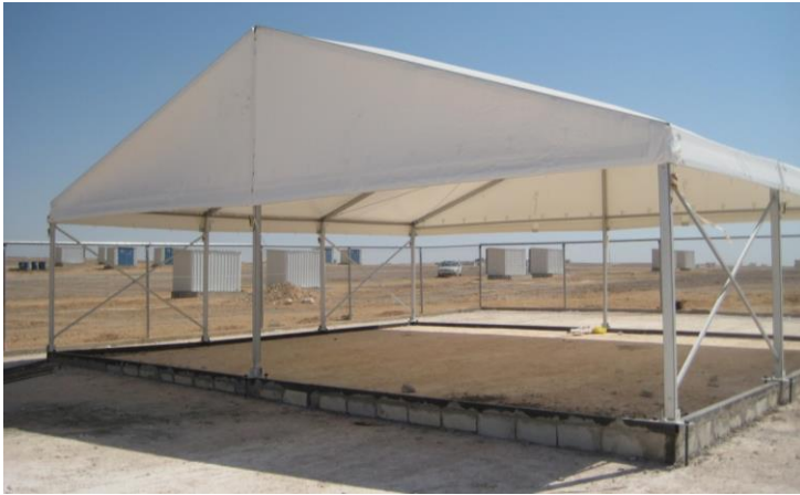
Azraq camp Child Friendly Space 1