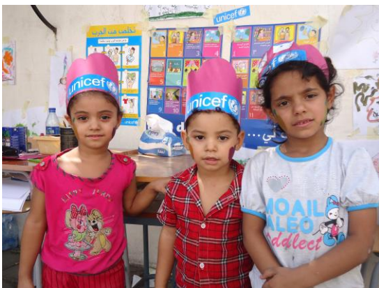
PRS children attend PSS activities at UNRWA distribution sites.

The Child Protection in Emergencies working group (CPiEWG) is developing a Child Protection Policy for members providing services to children displaced and affected by the Syrian Crisis. Members will adopt the policy as a statement of commitment to safeguard children. Following field reports on the increasing number of child labour cases, preparations are underway for the roll out of a working street children survey with the support of UNICEF, ILO and Save the Children. The survey will be conducted in September - October 2013 through members of the CPiEWG.