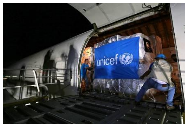
The supplies include water tanks, emergency health and hygiene equipment, water purification tablets, as well as early childhood development and recreation kits and will provide vital services for over 20,000 Syrian refugee children and their families

In the new Kawergosk camp, where 17,000 refugees are residing, UNICEF and the Kurdistan Regional Government (KRG) are trucking water into the camp on a daily basis. With Norwegian Refugee Council (NRC), UNICEF has established two 45,000L tanks with four tap stands in the camp and has distributed 3,400 hygiene kits covering the entire camp population. UNICEF and NRC are also drilling two boreholes; preparing to lay pipe for a water network in a new section of the camp; installing 400 latrines and providing garbage collection throughout the camp on a daily basis.