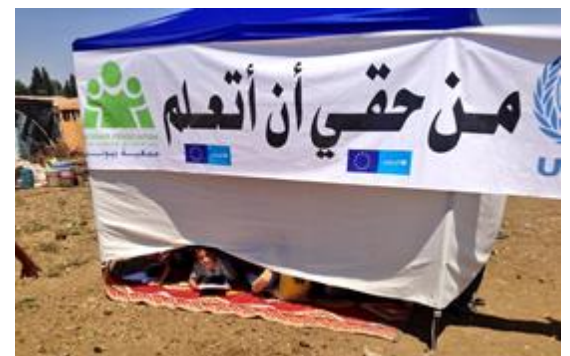
Tented classroom in the Bekaa operated by Beyond and supported by UNICEF through EU funding. UNICEF/Lebanon/2013/Baar

The first cycle of Accelerated Learning Programme (ALP) curriculum was developed by Center for Education Research and Development (CERD), a technical institute within Ministry of Education and Higher Education (MEHE), with support of UNICEF. The ALP curriculum will enable out-of-school children to access and complete the first cycle of the primary education (Grade 1-3). UNICEF is working with MEHE to develop a complete non-formal education curriculum to ensure access to complete basic quality learning of Grade 1 to 6 for out of school children.