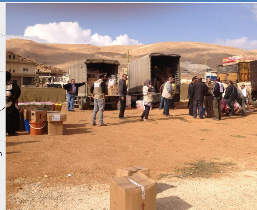
Aid workers assist recently arrived Syrian refugees from Qarah at the Norwegian Refugee Council's Community Center in Arsal, 2013-11-17