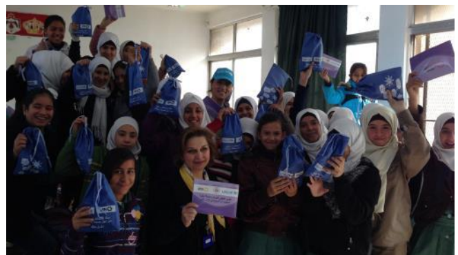
Schoolchildren participating in UNICEF/JEN hygiene promotion session in a host community school.

UNICEF/JEN are currently conducting hygiene promotion trainings and sessions in host community schools. As of 27 November, 650 teachers in 94 schools received hygiene messaging through training of trainers, and student sessions were held at 17 schools in Mafraq, Amman and Zarqa, reaching a total of 11,819 children. After the hygiene promotion sessions, each student received a hygiene kit containing information materials, toothpaste, a toothbrush, towel and soap. Through 312 hygiene sessions, 679 teachers and 23,983 students have benefitted to date.