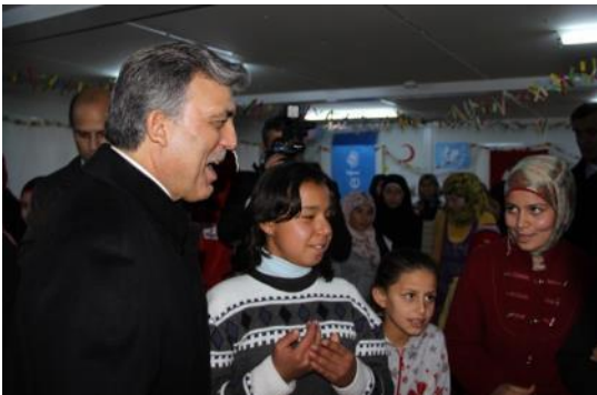
President of Turkey, Mr. Abdullah Gul, visited Kilis camp

AFAD has reported that 755 Syrians are now accommodated in Viransehir camp which officially opened over the weekend. The first transfers to Viransehir camp came from Kilis transit centre, where there has been overcrowding. In addition, Government officials reported that approximately 300 Syrians were also transferred to Viransehir camp from the waiting area in Akcakale camp. The officials in Viransehir camp stated that the transfers will continue during the week both from the waiting areas in Akcakale and Ceylanpinar camps, as well as from Bab Al Salame camp.