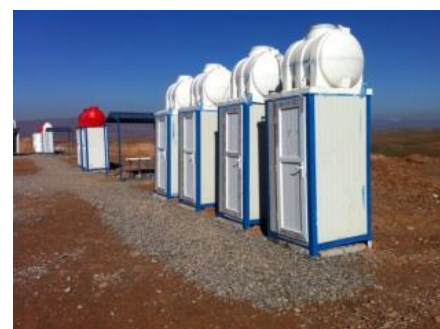
School WASH facilities in Darashakran