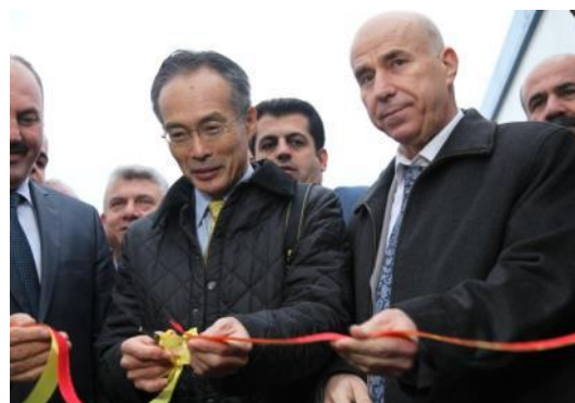
The Japanese Ambassador to Iraq and the Governor of Erbil inaugurate the opening of a baby hut in Darashakran camp

On 5 December, UNICEF hosted the Japanese Ambassador to Iraq, the Governor of Erbil and the Mayor of Darashakran at the inauguration of a new baby hut and immunization centre in Darashakran camp. The services in these facilities, enabled by a grant from the Government of Japan, will now constitute a main pillar of the UNICEF child survival strategy for the camp. The baby hut will provide a space for new mothers to receive educational services on breast feeding best practices, appropriate diet during nursing and child growth monitoring. Meanwhile, the adjacent immunization hut will provide routine immunization services and mass campaign vaccinations as required.