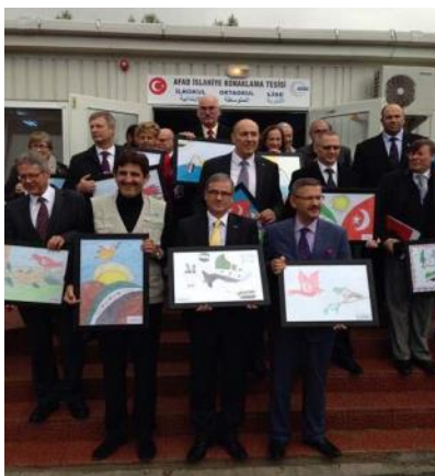
European Union delegation visit to CFS

On 29 November, a delegation of 15 European Union Ambassadors visited UNICEF activities in the CFS and UNICEF-funded school in Islahiye camp. The visit was part of a full day visit to stakeholders in Gaziantep and programmes receiving funds from the European Union. The members of the delegation met with camp management, and were then greeted at the CFS with drawings created by children attending the space, and a musical performance. The delegation also met with some of the families living in the camp.