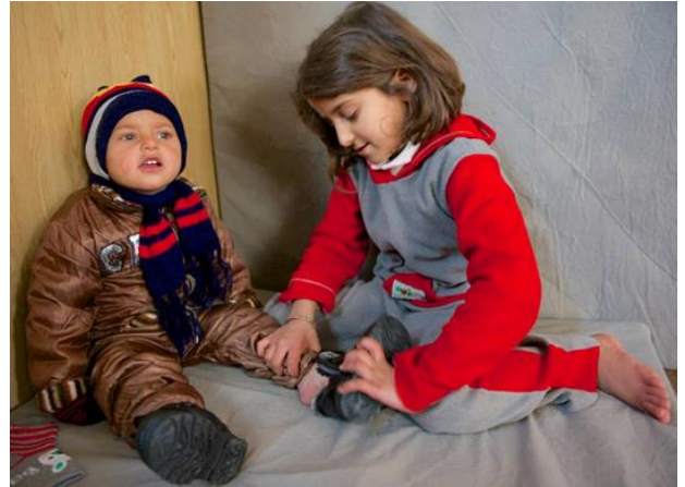
A girl in Za'atari helps her sister put on winter clothes provided by UNICEF

UNICEF and JEN carried out an emergency joint distribution of winter items in cooperation with the Civil Defence Department of the Governorate of Balqa to support some 500 Syrian refugees residing in spontaneous settlements in Jordan Valley affected by the recent floods/inclement weather. Syrian refugee families received winter items (thermal blankets, plastic sheets, and JEN-procured winter clothes/shoes) along with basic water kits (jerry cans, bucket and soaps). The distribution also included some 90 children under 5 years old who received extra winter items such as basic winter clothes, shoes and baby blankets. Preliminary information from a REACH/ACTED rapid survey indicates that there are almost 3,300 Syrian refugees living in over 30 spontaneous settlements identified in Jordan.