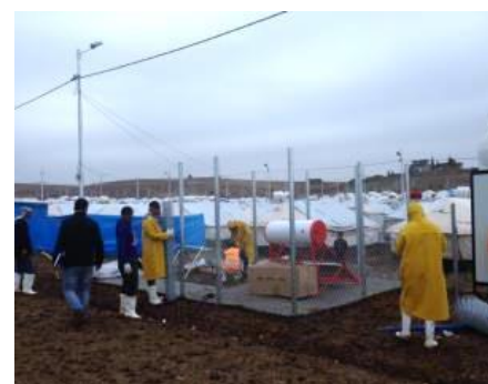
Construction of hot water stations in Kawargosk

Kawargosk: UNICEF, in coordination with the Norwegian Refugee Council, began construction and installation of twenty-five hot water stations and privacy fencing for female latrines in the camp. UNICEF anticipates that this construction will be complete by the end of December, benefiting 5,000 Syrian refugees.