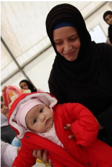
Children's winter clothing distribution