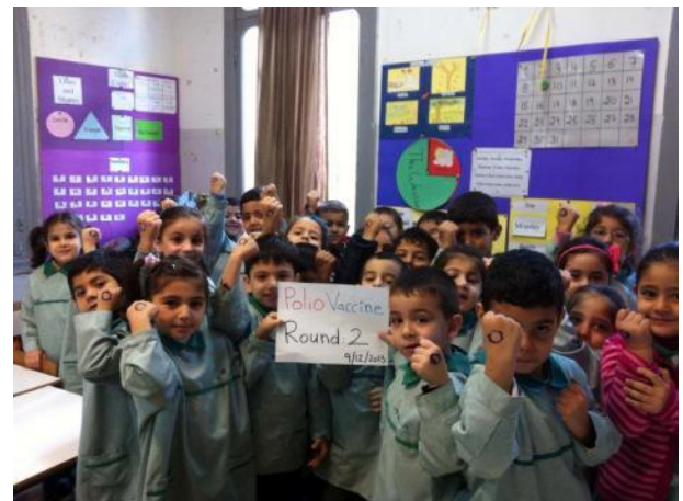
Polio Campaign Round two at Rawdet Borj Abi Haidar School

Nutrition To date, IOCC has screened a cumulative total of 3,359 children for malnutrition. Of those screened, 83 children (2.5 per cent) have been found to have moderate or severe acute malnutrition without complications and are being treated as outpatients. A further 32 children (0.95 per cent) with severe acute malnutrition with complications are being treated in hospital. IOCC have trained a further 20 healthcare workers on nutrition in emergencies, bringing the cumulative total to 220 people trained. Seventy pregnant and lactating women are also receiving micronutrient supplements.